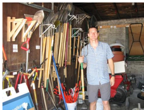
Selection of shovels and rakes