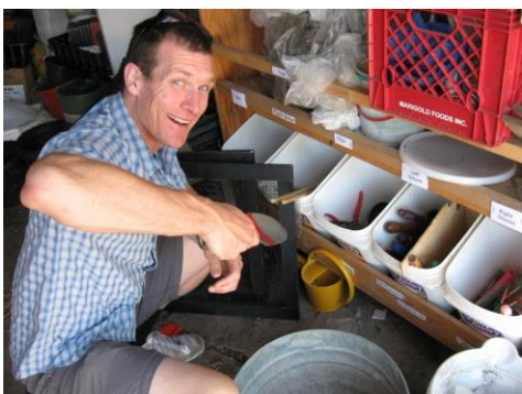
Hand tools in the Park Place garage